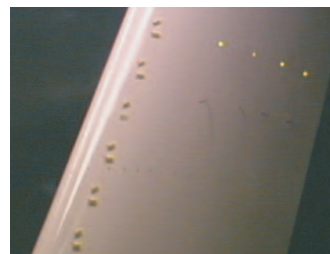
Journal of Aircraft , Vol. 40, Number 5, Sept.-Oct. 2003

ORI has successfully developed and demonstrated an active transparent stall control system for aerodynamic applications. The system utilizes sensors, actuators, and a closed-loop controller to enable active detection-and-control of local flow separation so as to delay wing stall. The technique is independent of control inputs from the on-board flight control system and hence termed "transparent". The method of predicting flow separation is based on the identification of characteristic shifts in the power spectrum of the pressure fluctuations upstream of flow separation. Micro-vortex generators were used for controlling flow separation. This control system can be adapted to work with a variety of flow control actuators that are effective in controlling flow separation. This system is an enabling technology for the "smart-wing" concept