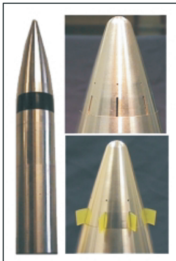
Deployable flow effectors, dynamic pressure sensors, and real time closed-loop controllers are integrated near the tip of the nose cone.

"... Orbital Research is developing a phantom yaw control system for weapons at high angle of attack (AoA), where conventional control surfaces become ineffective. This system integrates active microvortex generators, dynamic pressure sensors, and real-time closed-loop controllers into isolated modules placed near the tip of the nose cone. During wind tunnel testing of a prototype system, a desired yaw moment was generated and maintained over a large range of commanded values during high- AOA pitch sweeps. A similar system is under development for autonomous aircraft wing stall control."